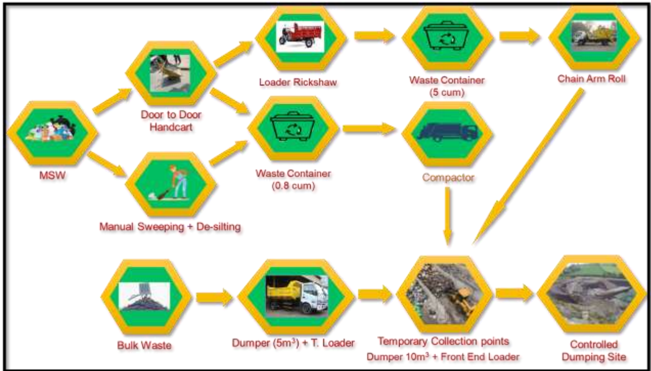
Figure 1: Proposed SWM Model for Urban Areas