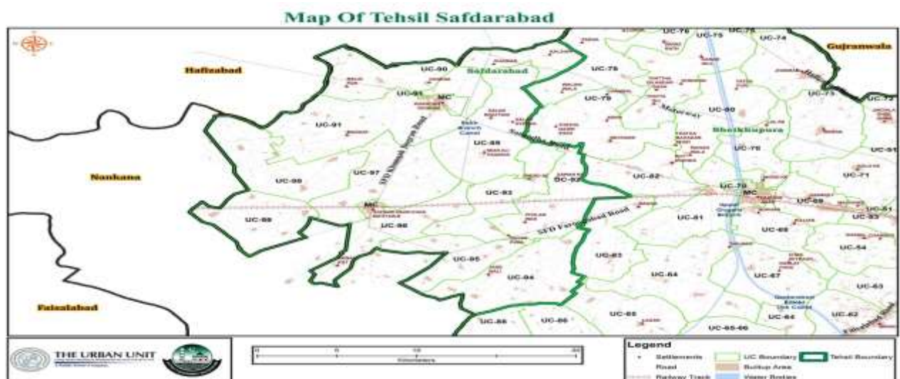
Figure 1: Map of Tehsil Safdarabad

Map of Tehsil Safdarabad is attached below: